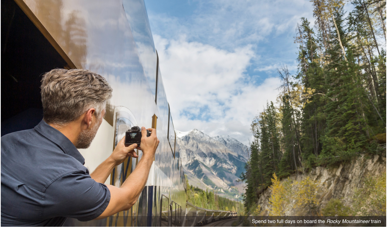
Spend two full days on board the Rocky Mountaineer train