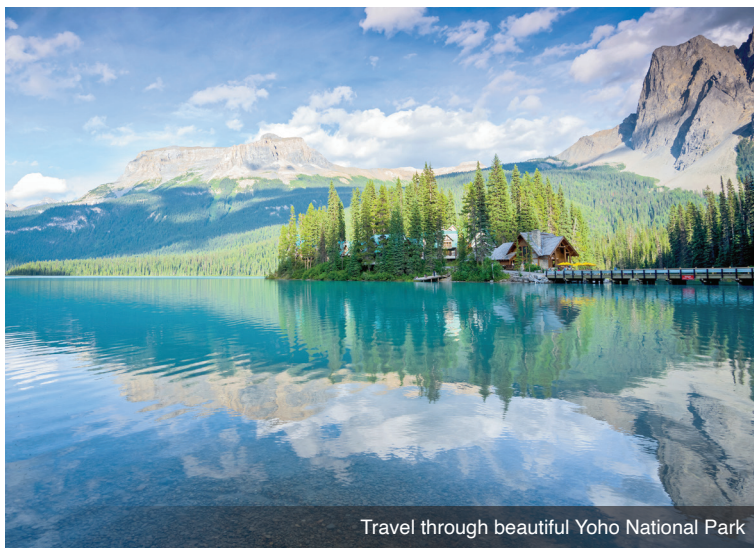
Travel through beautiful Yoho National Park

DAY 8 Return Home: Following breakfast, depart with a group transfer to the Calgary International Airport for flights out after 11:00 a.m. Meal: B