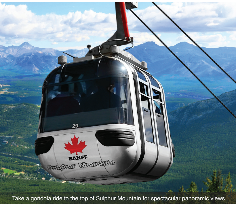
Take a gondola ride to the top of Sulphur Mountain for spectacular panoramic views

DAY 7 Calgary Tower and Heritage Park: Get to know Calgary on a panoramic sightseeing tour of the city. Get your first glimpse of the Canadian Rockies from high atop the 626-foot tall Calgary Tower. Then, take a step back into Canada's colorful past at Heritage Park. Here you will learn about life as a 19th-century fur-trader or old-fashioned blacksmith. In the Gasoline Alley Museum, admire the collection of 1908 REO Autobuggies and 1912 Buicks, or stroll through Heritage Town Square and chat with the locals in their traditional clothing. Tonight, your Tour Manager hosts a farewell dinner. Meals: B, D